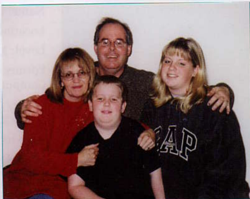
The King Family of Warwick, RI.